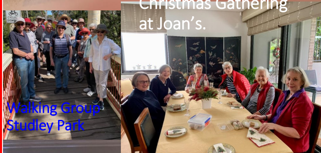
Walking Group Studley Park