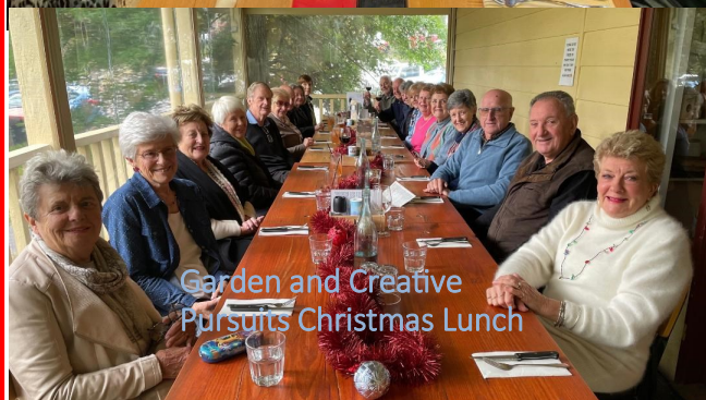
Garden and Creative Pursuits Christmas Lunch